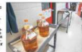
Solutions used in growing media Tuesday stand outside a preparation room. Employees say they have had to find ways to store the items they use to accommodate their rapidly expanding test caseload.