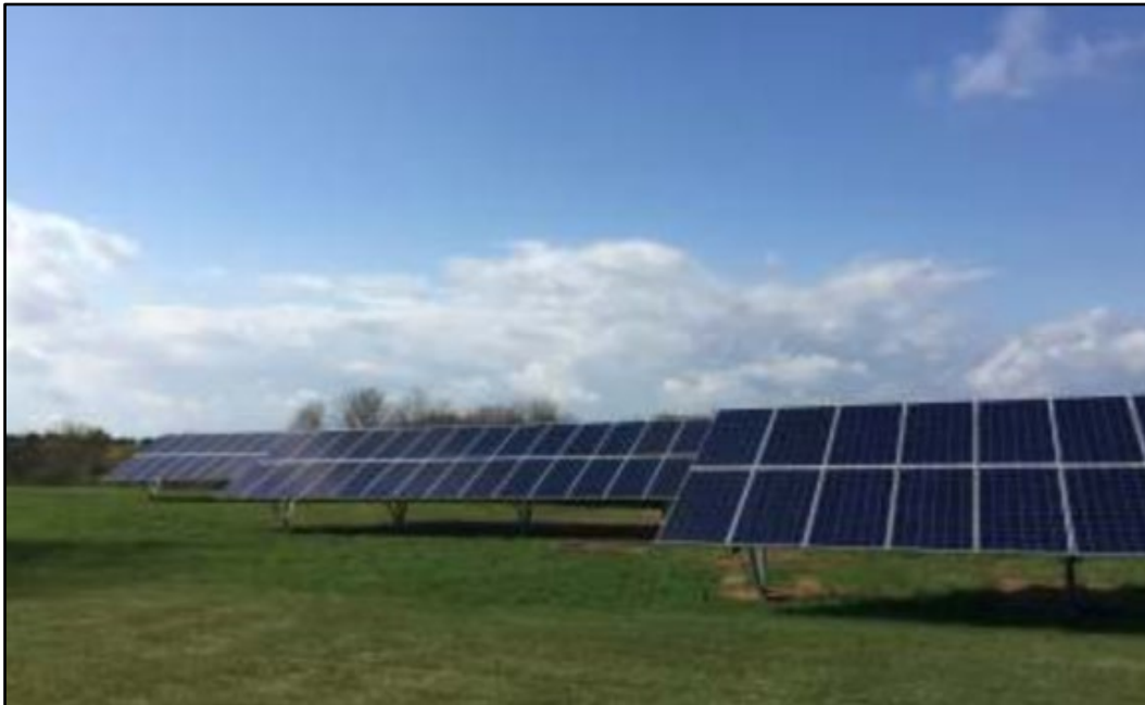
ISU lease: example of ground-mounted solar panels