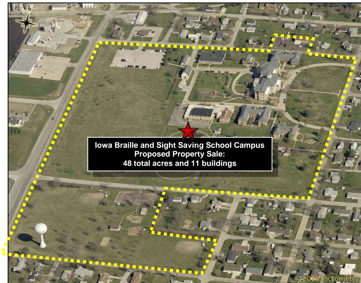
Iowa Braille and Sight Saving School Campus, Vinton