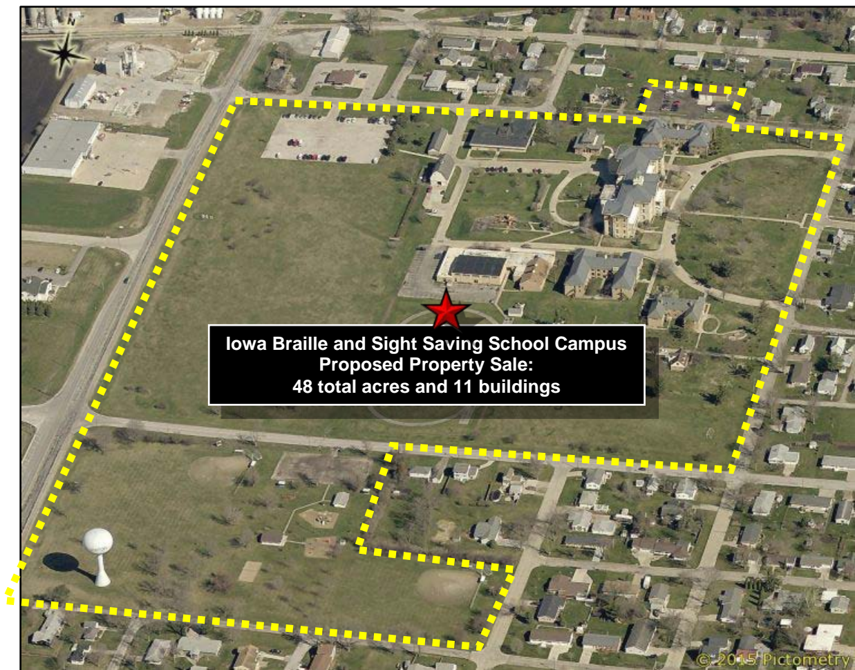
Iowa Braille and Sight Saving School Campus, Vinton