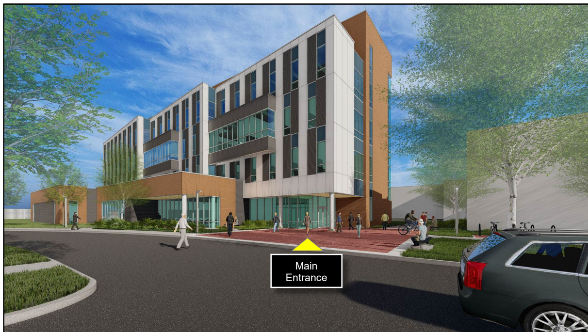
ISU's Therkildsen Industrial Engineering Building, looking northwest

This proposed 77,000 gross square foot facility would provide new space on the west side of campus for teaching and research labs, classrooms and office space for the Department of Industrial and Manufacturing Systems Engineering of ISU's College of Engineering.