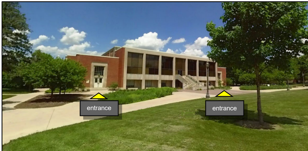
University of Northern Iowa's Commons, looking northeast

The University would accomplish this by completely renovating the building. A new, more prominent entrance would be created. ADA access would be improved and provided to all levels of the building. Deferred maintenance identified in a 2023 building assessment including code compliance items, exterior envelope, interior finishes, mechanical, electrical, plumbing, and technology system upgrades, would be addressed and that would renew the building's role as a showpiece of the University.