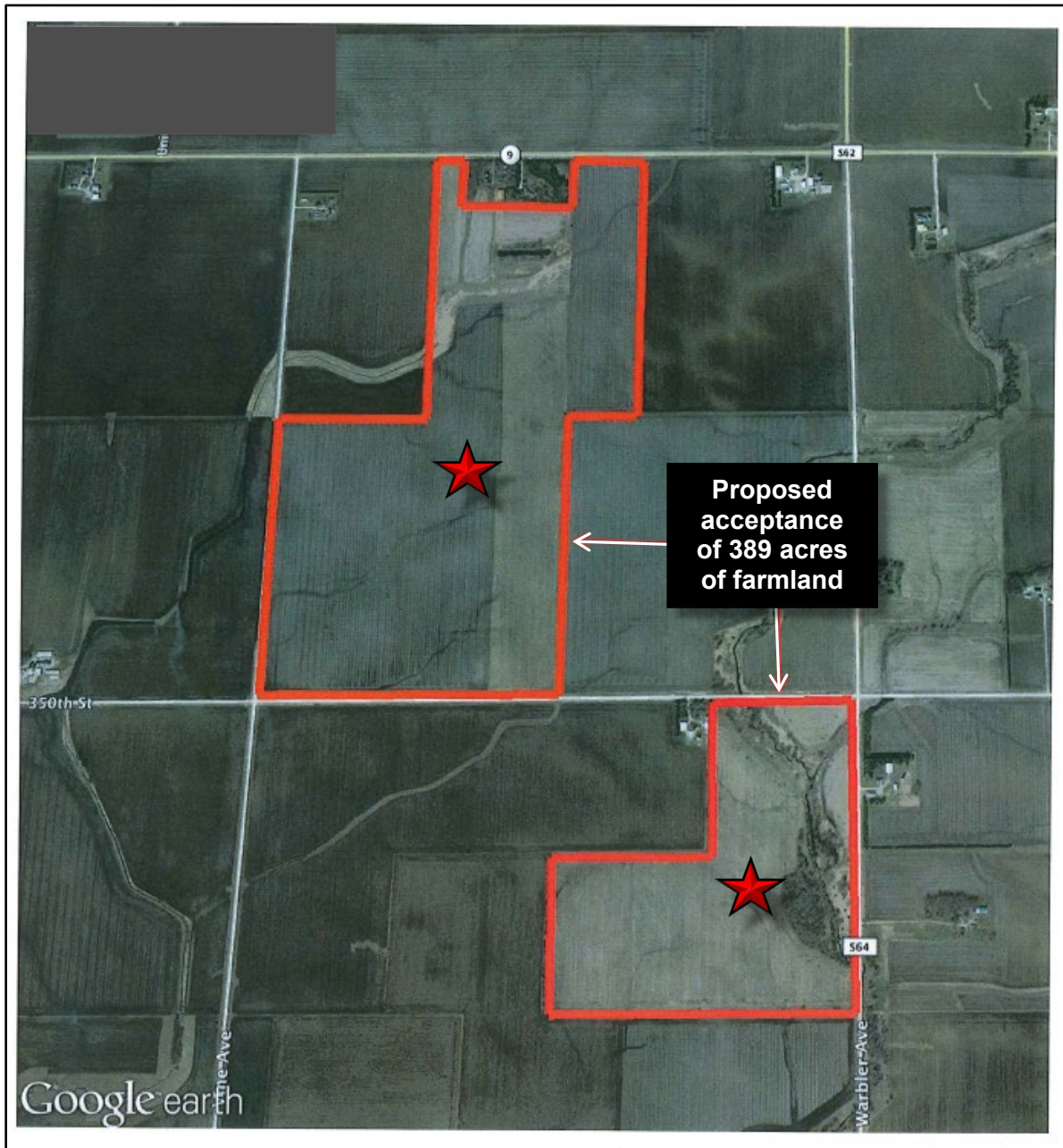
Gregory Farms in Worth County, northwest of Mason City

The ISU College of Agriculture and Life Sciences would manage this farmland, as it does other locations around the state. The resulting income would support educational and research programs relating to companion animals as required by the RTA. In addition, the ISU College of Agriculture and Life Sciences would be able to collect agricultural data from operation of the farm.