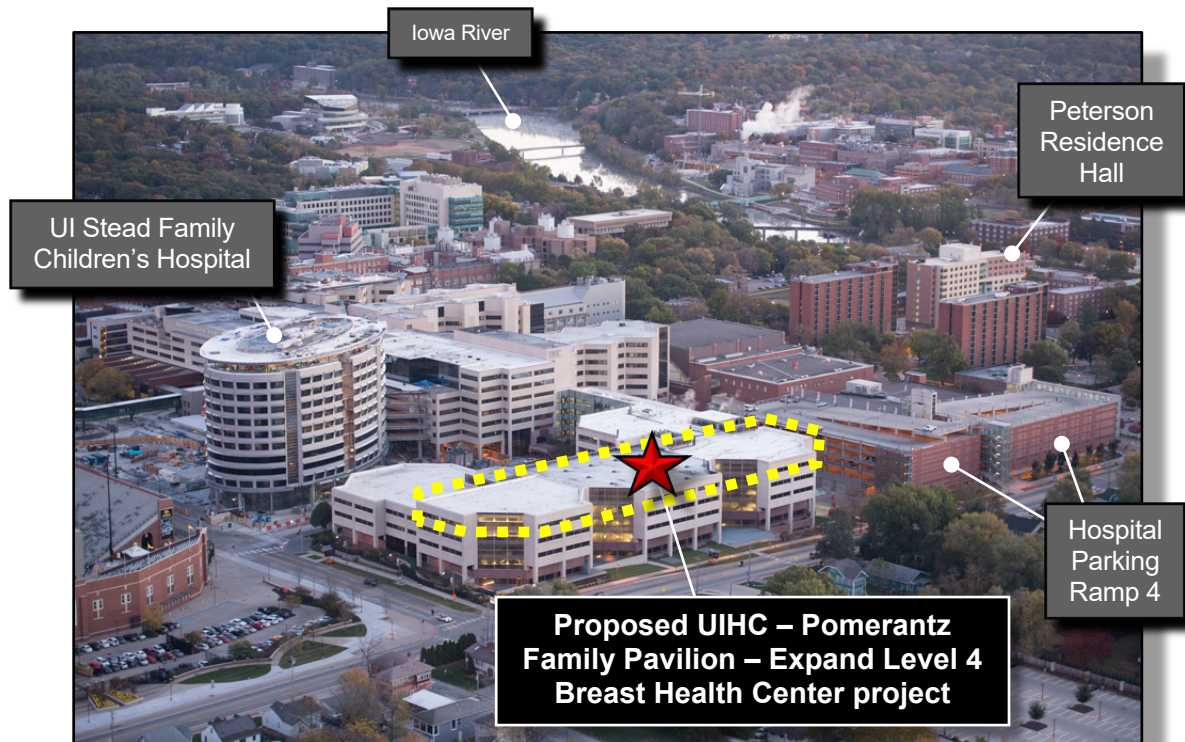
UIHC Pomerantz Family Pavilion, built in 1996: looking northeast

Expanding and consolidating the UIHC Cancer Center, Breast Health services on Level 4 also allows new oncology providers to utilize space on Level 3, where breast physicians are currently seeing patients.