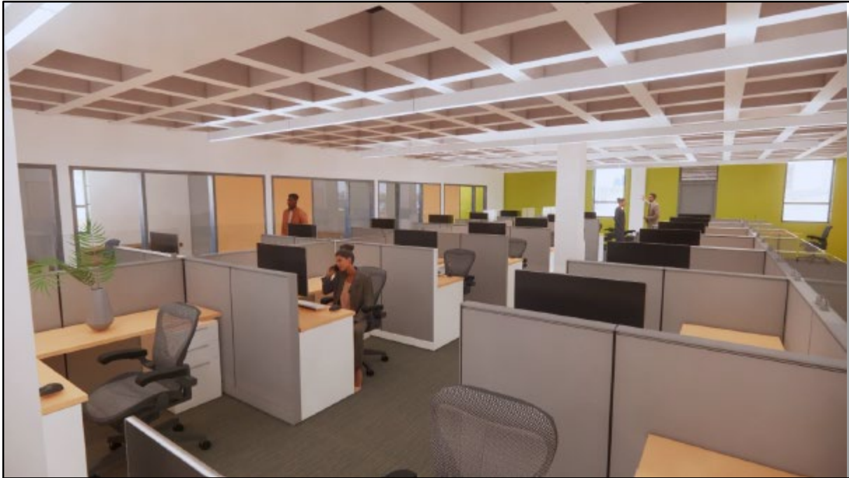
Pharmaceutical Sciences Research Building, 2nd floor