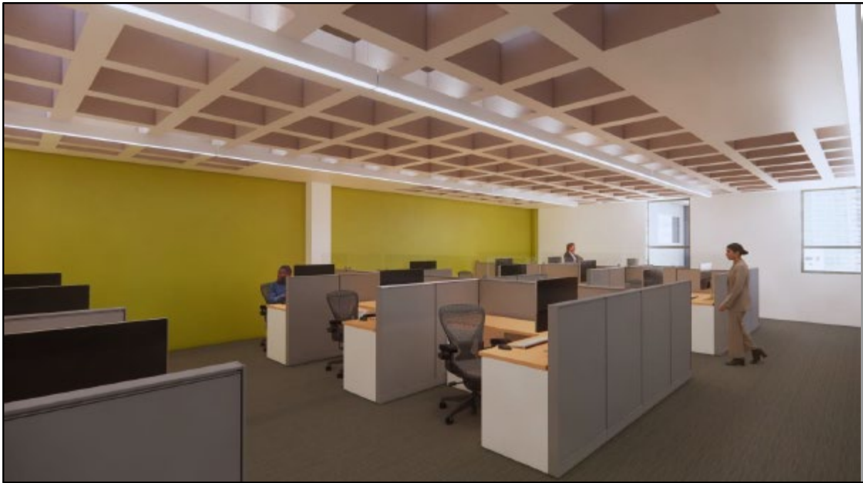
Pharmaceutical Sciences Research Building, 3 rd floor