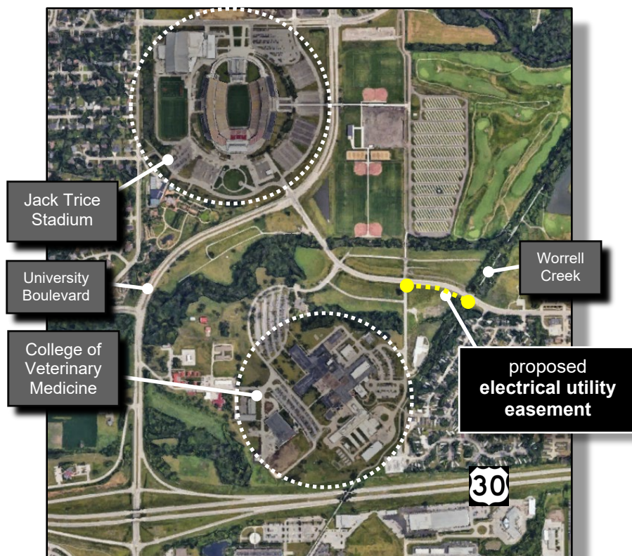
Iowa State University, southeast of central campus